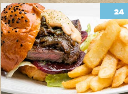
Gourmet Steak Burger