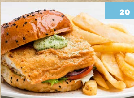
Crumbed Fish Burger