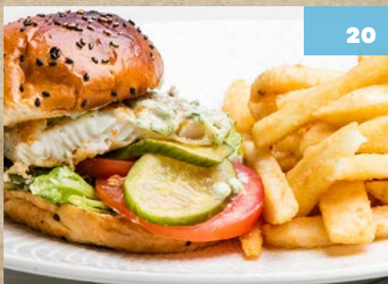
Battered Fish Burger