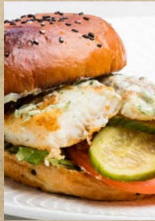
Grilled Fish Burger