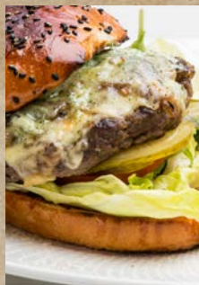
Gourmet Beef Burger

Extras $2 • Egg • Cheddar cheese • Grilled pineapple